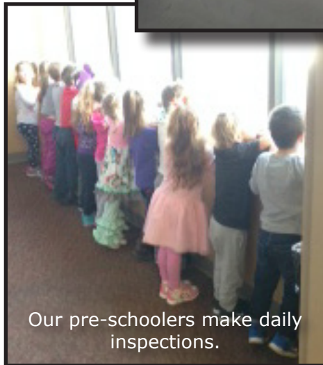
Our pre-schoolers make daily inspections.