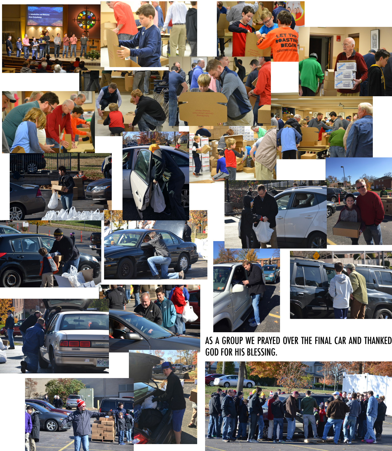
AS A GROUP WE PRAYED OVER THE FINAL CAR AND THANKED GOD FOR HIS BLESSING.